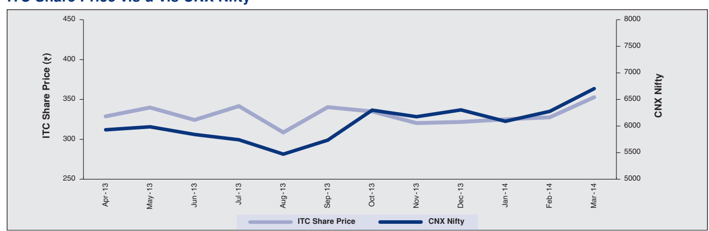
Note - Indicates monthly closing positions.

During the financial year 2013-14, the CNX Nifty has risen by 18%. During the same period, the Company's share price has risen by 14%.