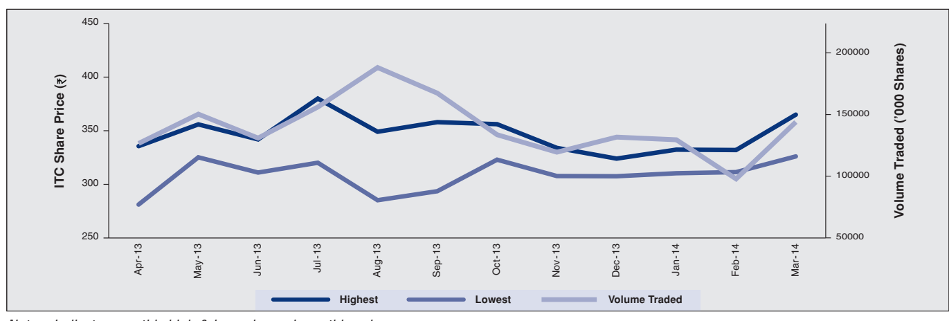
Note - Indicates monthly high & low price and monthly volume.